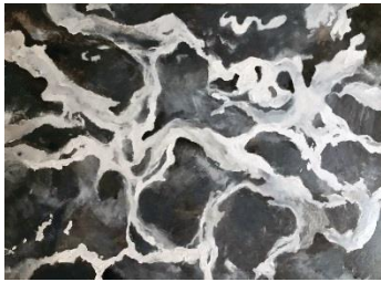
[water] – MERCIFUL