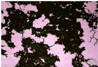
[air] – SACRIFICE